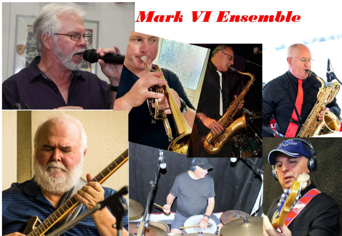
Mark VI Ensemble